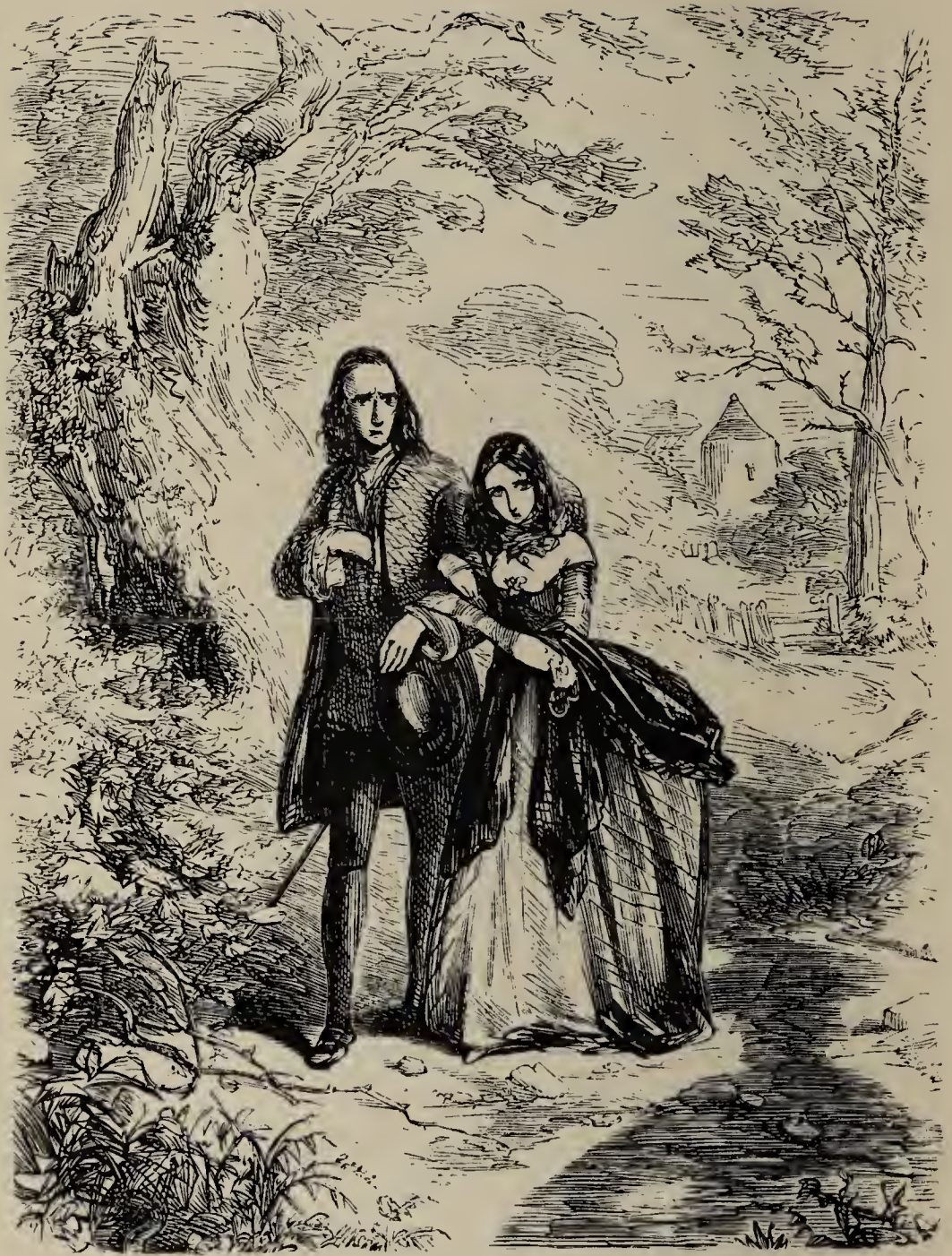
EUGENE ARAM AND MADELINE.—p. 257.